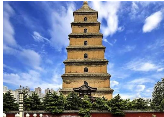
Big Wild Goose Pagoda