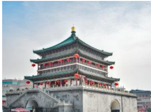
Xi'an Bell Tower