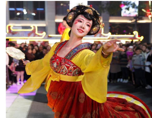
The Ancient Culture of Xi'an